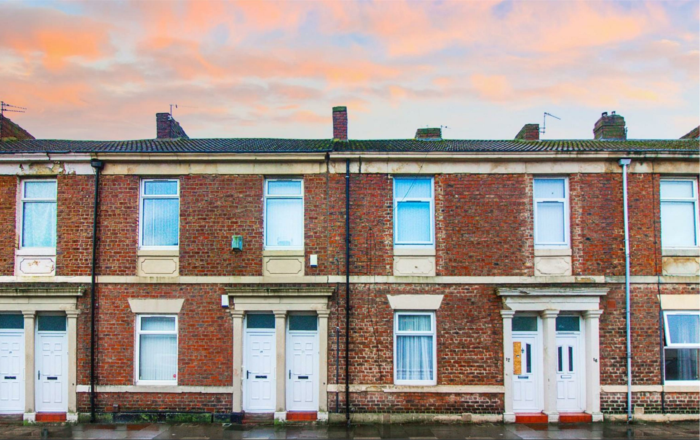
📍 Grey Street, North Shields NE30 2DZ